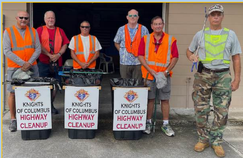
Highway Cleanup — September 6