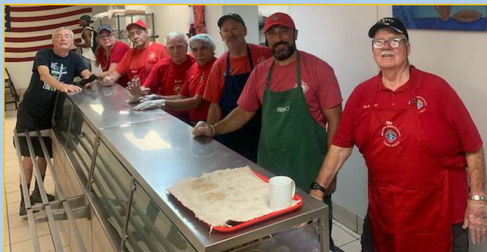
Daily Bread — September 22