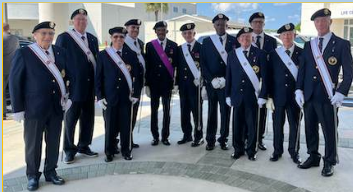
Color Corps — Funeral at Holy Name of Jesus