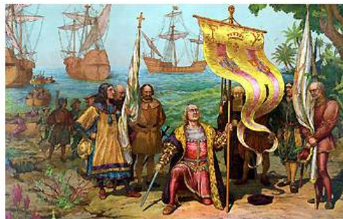
The Catholic Spirit of Christopher Columbus

As the sun set, the Salve Regina hymn rang out across the Atlantic. Ninety men stood on the decks of three boats, led in prayer by Christopher Columbus, the foreign captain they had come to trust. They had kept the same ritual of evening prayers since they left Spain months ago, but tonight was different. Tomorrow would be the Feast of Our Lady of the Pillar, Spain's great patroness. Columbus had promised his men that had they not spotted land by her feast day, he would order the ships to turn back, a promise he intended to keep. He knew Our Lady would not abandon the enterprise he had worked so hard to bring about. The signs that they were near land were increasing by the day.